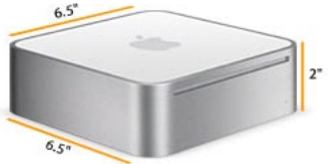
MAC MINI Dimensions

MACWORLD EXPO, SAN FRANCISCO—January 11, 2005— Apple® today announced it has teamed up with Mercedes-Benz USA, Volvo, Nissan, Alfa Romeo and Ferrari to deliver iPod® integration with their car stereo systems in 2005. The iPod Integration Kit for Mercedes-Benz will debut this April in the US with the newly redesigned 2006 Mercedes-Benz M-Class, and Volvo will offer two iPod connectivity options for their entire 2005 US model line. Nissan, Alfa Romeo and Ferrari will announce details of their iPod integration solutions later this year, allowing customers to enjoy high-quality sound through their car's stereo system, easily access their entire music library and control their iPod using their car's standard controls. These companies join BMW and MINI Cooper who began providing integrated iPod solutions in 2004.