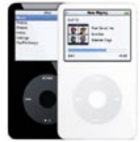
The new Video iPods

iPod requires a Mac with a USB 2.0 and Mac OS® X version 10.3.9 or later and iTunes 6. 🍏