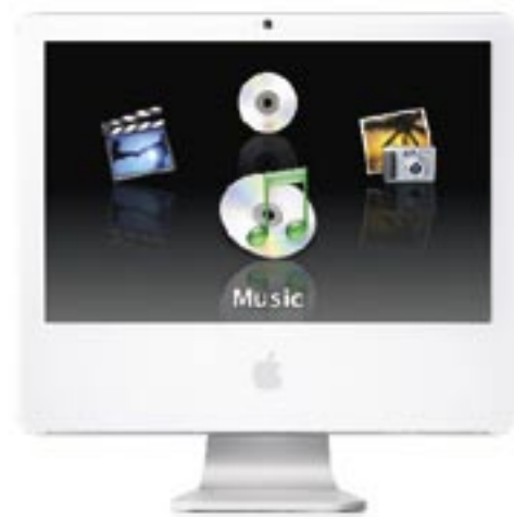
The New iMac G5 with remote controlled Front Row

Every new iMac G5 also includes iLife® ‘05, Apple’s award-winning suite of digital lifestyle applications; Mac OS X version 10.4 “Tiger,” the world’s most advanced operating system; and a collection of productivity and entertainment titles including AppleWorks, Quicken 2006 for Mac, 2006 World Book, Photo Booth, Nanosaur 2 and Marble Blast Gold. 🍏