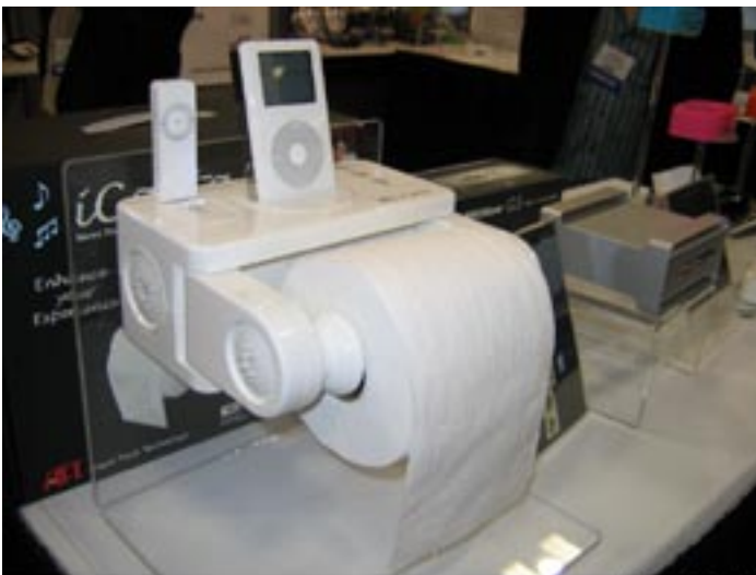
FOR THE PERSON WHO HAS EVERYTHING