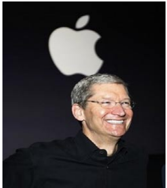
Apple COO Tim Cook an Auburn Univ. graduate

http://www.att.com/gen/press-room?pid=4800&cdvn=ne